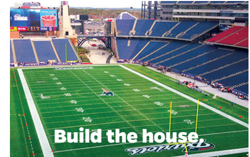
Build the house.

You can do any of this with a career in Manufacturing!