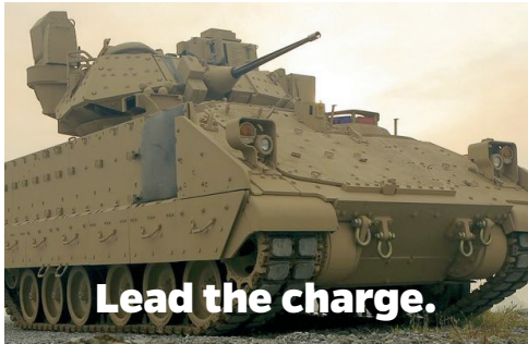
Lead the charge.