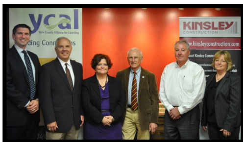
Select YCAL and Kinsley representatives meet to announce the Pre-Apprenticeship partnership

- York County Alliance for Learning Board of Directors