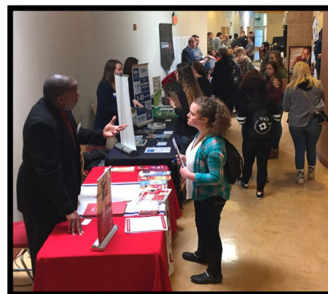
Students at the YCAL CREW Post-Secondary Expo visited with various educational, training, and school to work representatives

YCAL will be holding the next CREW on March 7, 2019 at HACC's York Campus.