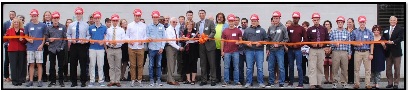
Students and representatives from Kinsley and YCAL cut the ribbon to launch the Pre-Apprenticeship Program on September 12, 2017

- York County Alliance for Learning Board of Directors