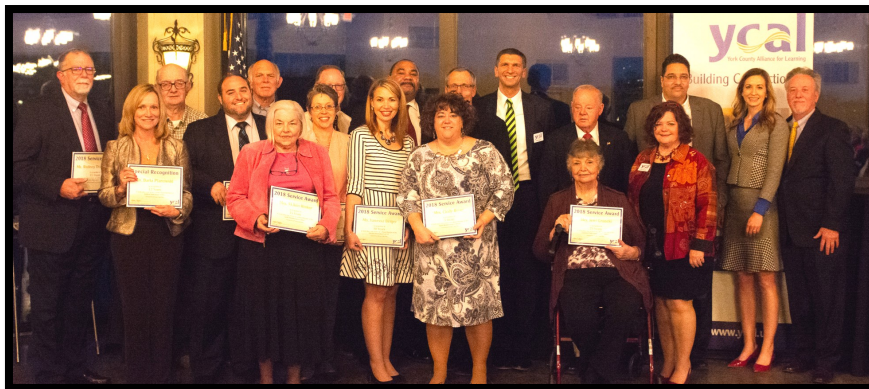
2018 School Director Service Award recipients