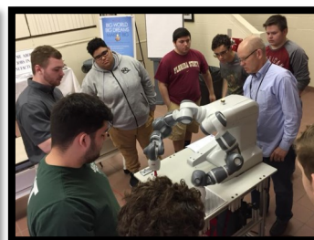
Students explore various career interests at YCAL's Respiratory Care, Skilled Trades, Education, and Manufacturing Career Exploration Programs