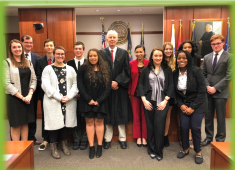
Students and advisors pose with Judge Craig T. Trebilcock, who presided over their Mock Trial. This was the culminating event for the Law Career Exploration Series Program.

The Career Exploration Day Programs and Career Exploration Series Programs once again expanded, with over 30 different career options offered in all 16 nationally-recognized career clusters. These programs continue to serve as an effective way to have students expand their awareness of the required education, training, skills, and character traits of each career. This awareness enables them to make more informed career decisions as they approach the end of their high school careers and finalize their career path. Through partnerships with over 25 different program hosts, YCAL impacted over 750 students. YCAL is planning to expand career exploration offerings to nearly 40 programs next school year.