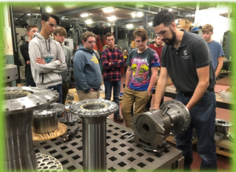
Students observe a demonstration from a machinist at Coupling Corporation of America, who hosted a group of students as part of the Manufacturing Days Tours program.

YCAL utilized over 100 business partnerships to deliver a direct career education and development impact to 1,200 students in the 2018-2019 school year.